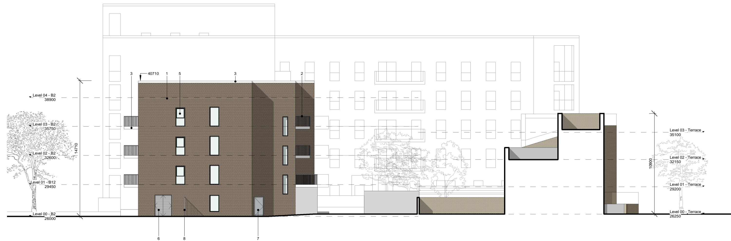
1 Block B - East Elevation 1:200